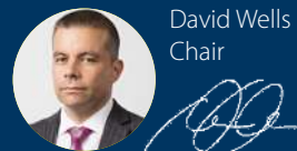
David Wells Chair